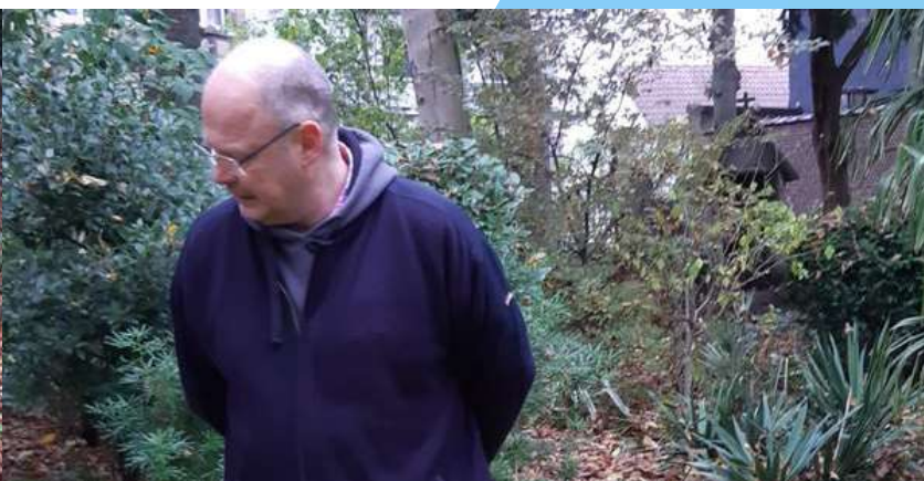
The Belgian parish priest who welcomed the statue of Father de Montfort